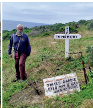
FoAICP volunteers at work on various Island maintenance activities.