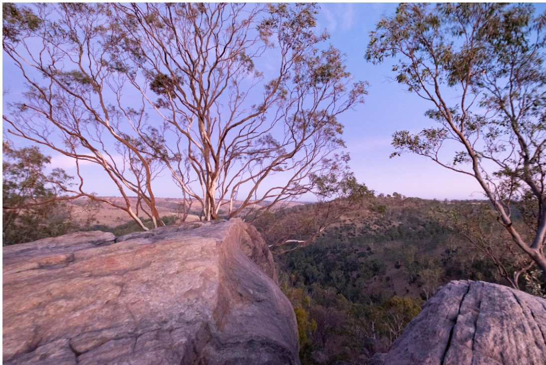
'Devil's Nose in Morning Light'