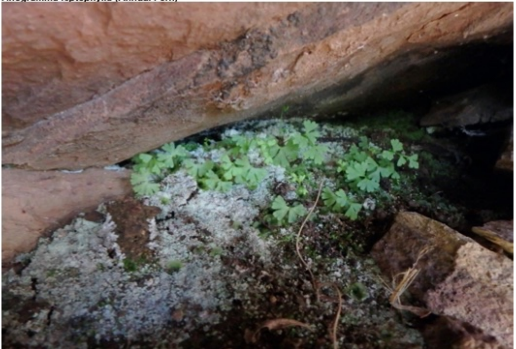
Anogramma leptophylla (Annual Fern)