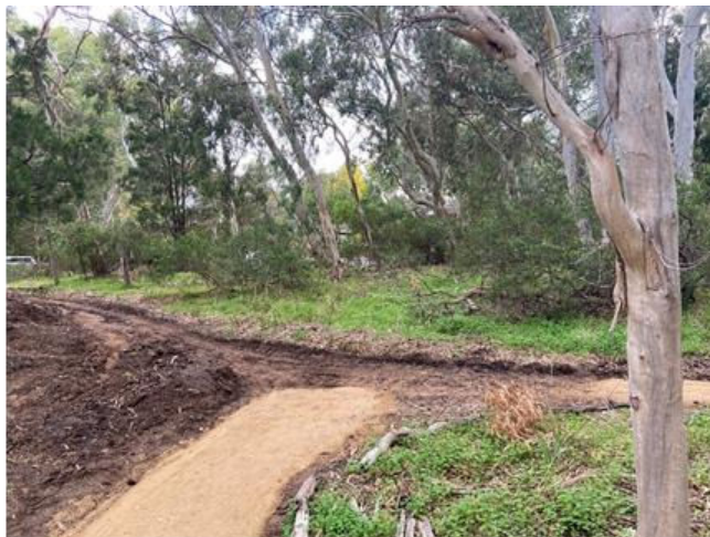
Trail rehabilitation work underway at the junction of Quarryman's Track and Oval Track.