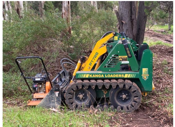
Equipment used to rehabilitate the trail included a stand-on Dingo 4-way bucket loader and a heavy vibrating plate compactor.