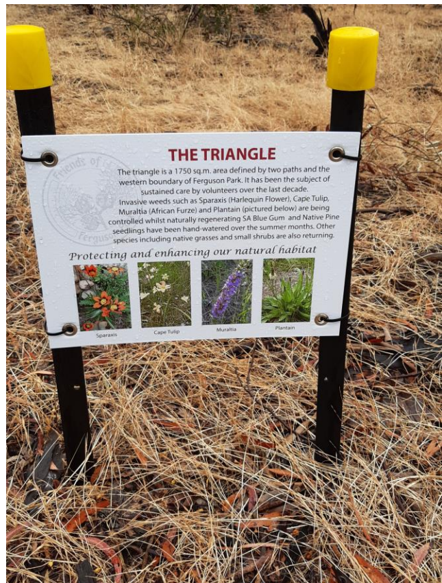
One of the new information signs installed in the Triangle.