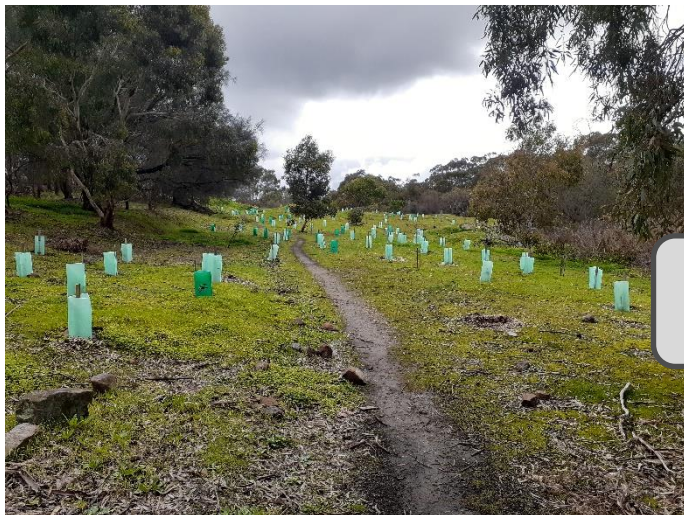
Areas around Lookout, Site B