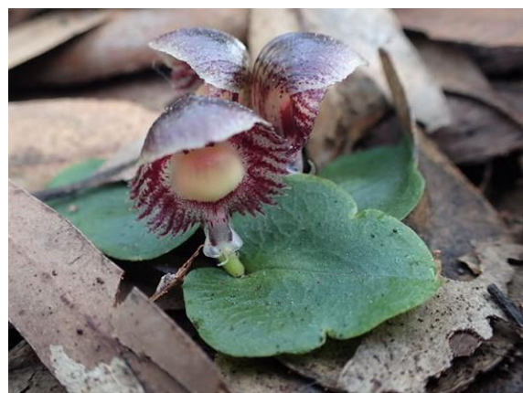
Veined Helmet Orchid Coryanthes diemenicus