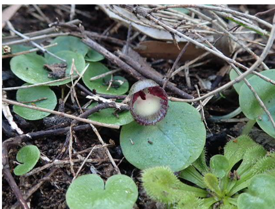
Slaty Helmet Orchid Coryanthes incurvus