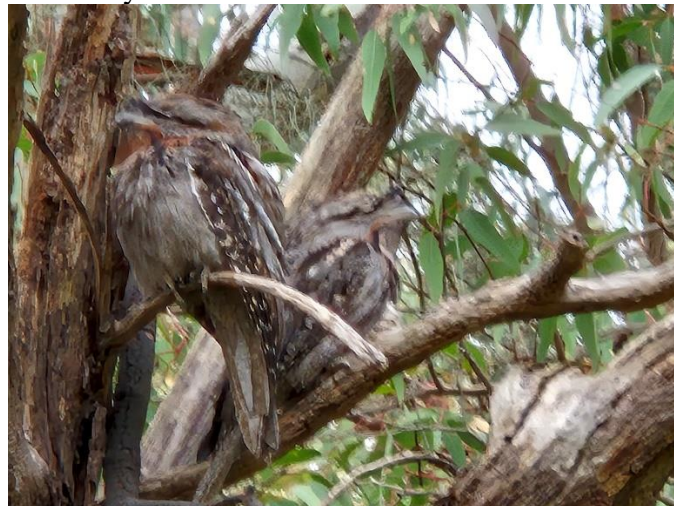
Tawny Frogmouth at Gate 1 Car Park

Joining Friends of Anstey Hill offers a unique opportunity to give back to nature, learn, and grow within a vibrant community dedicated to environmental conservation and sustainability.