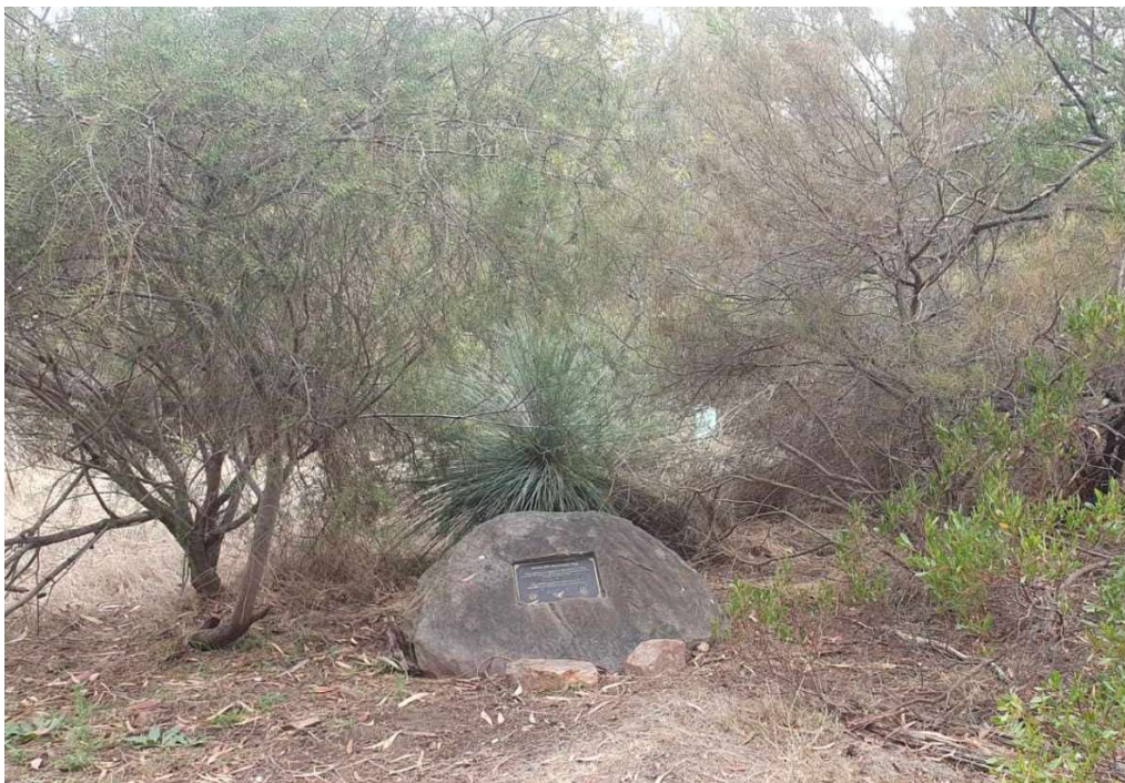
LOOKOUT PLAQUE - FEBRUARY 2024