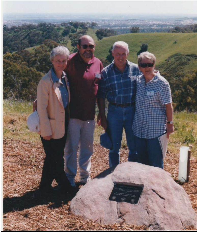
LOOKOUT PLAQUE - SEPTEMBER 1998