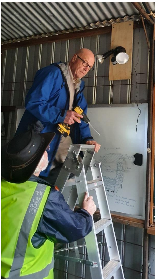
Installing a solar light in the shed