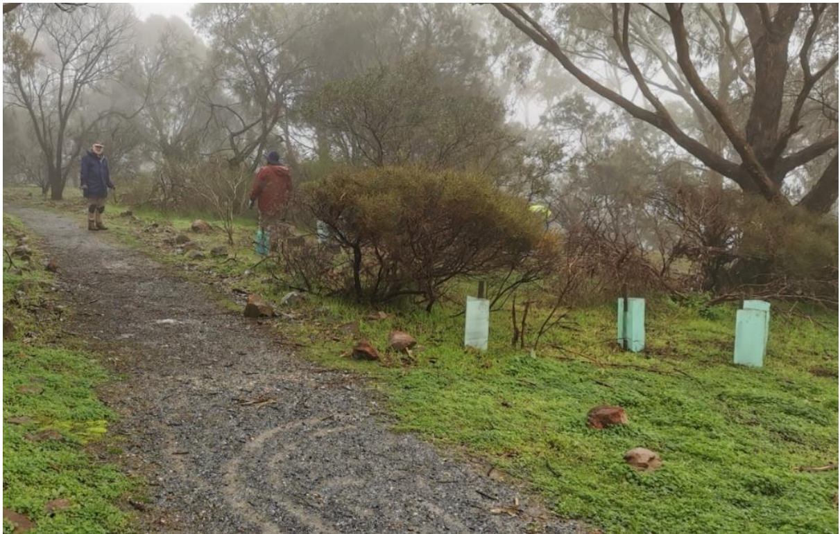
By the path to the Lookout