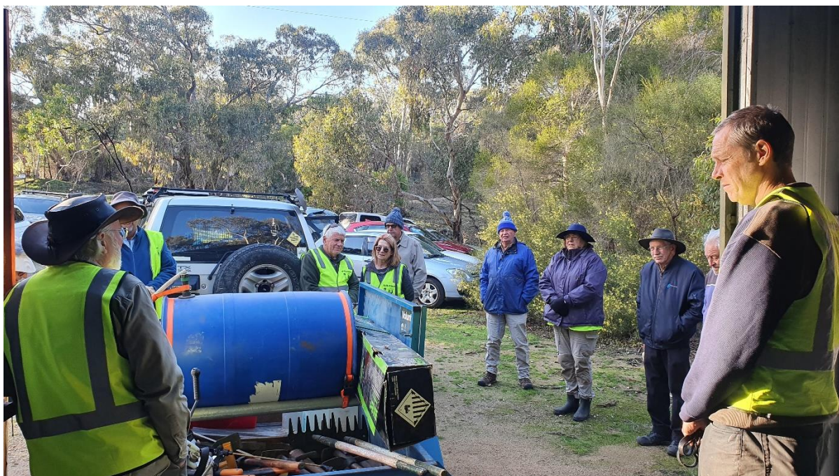
Early morning briefing on a cold day