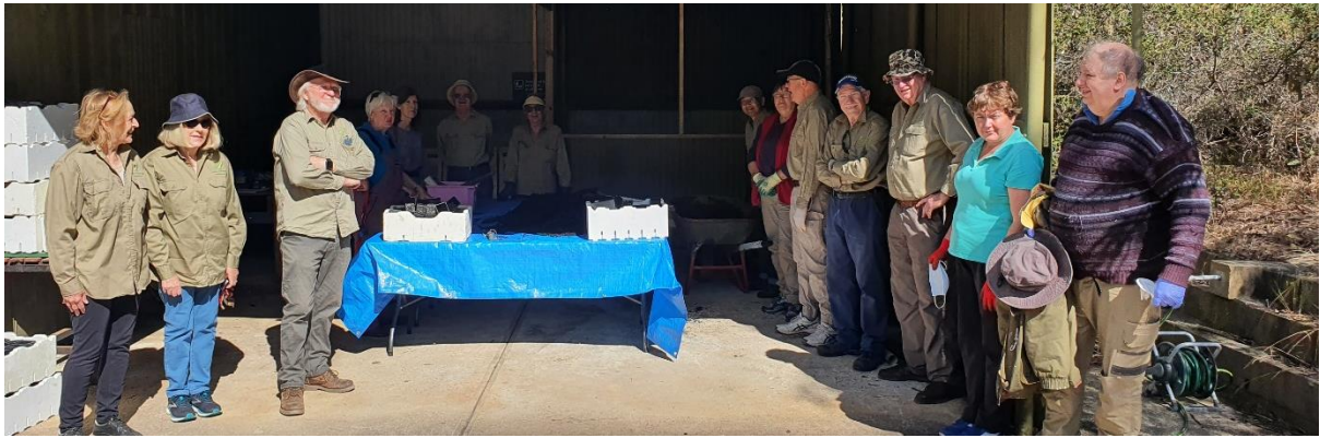
The Crew about to before the hard work