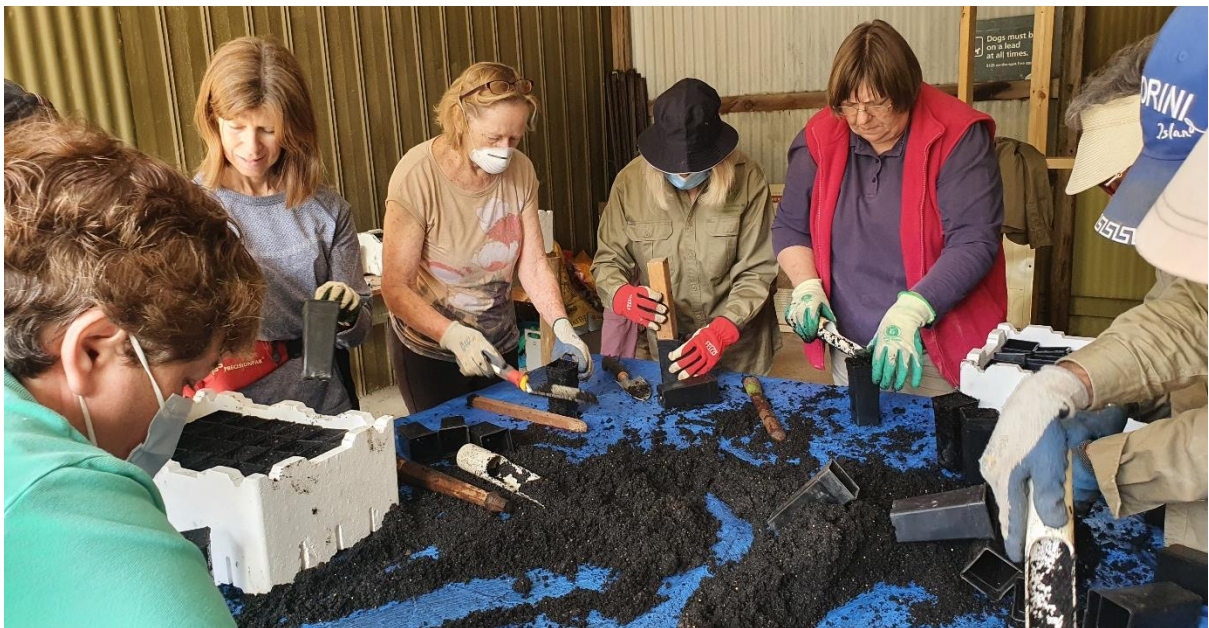
Filling and compacting the tubes