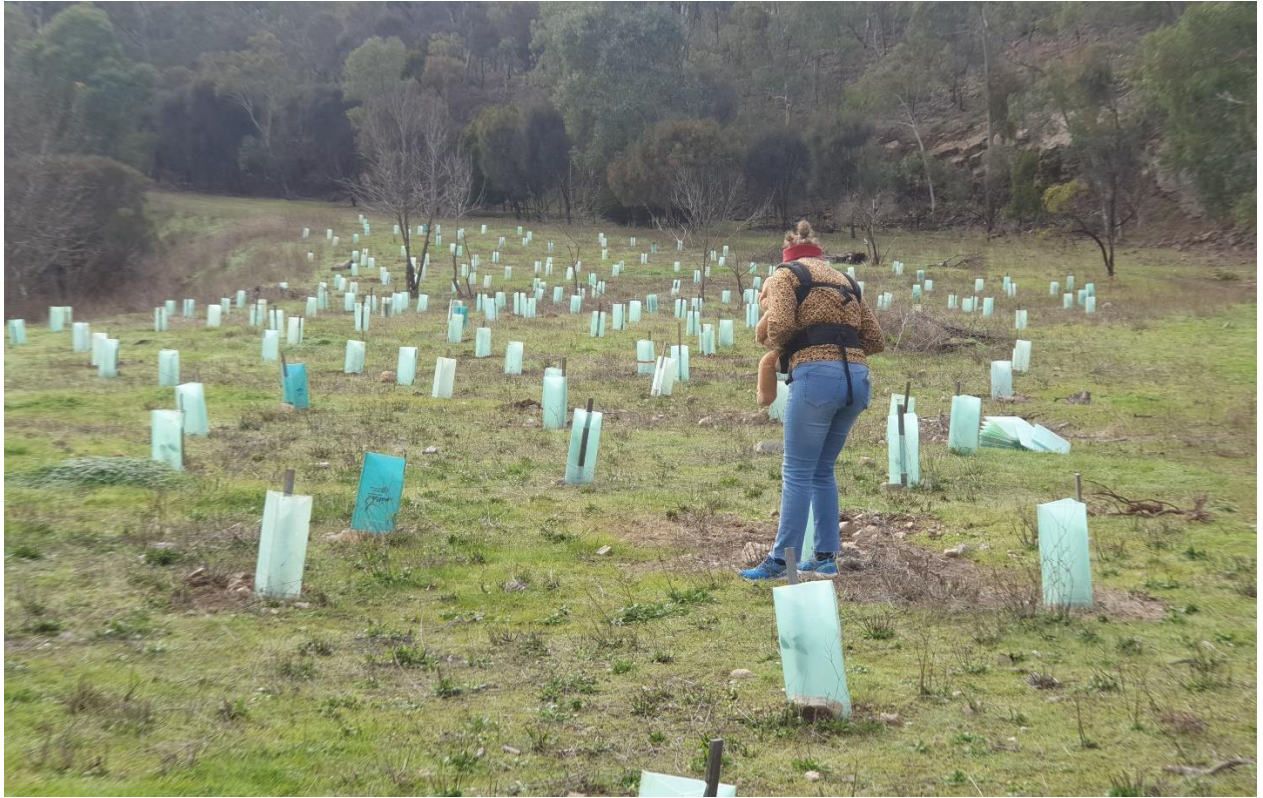
Inspecting the work up from Gate 1