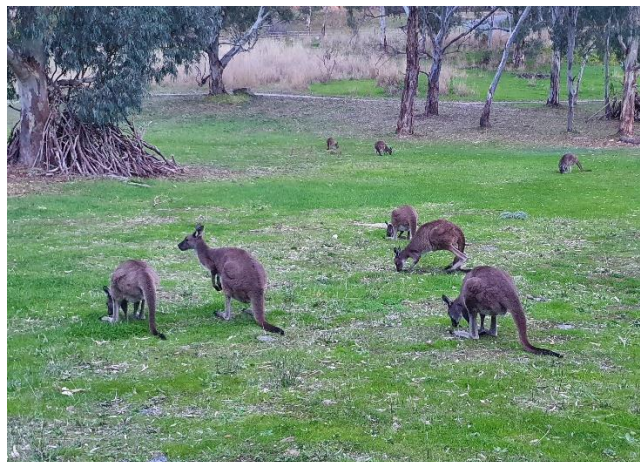
Visitors keeping an eye on their patch as we work