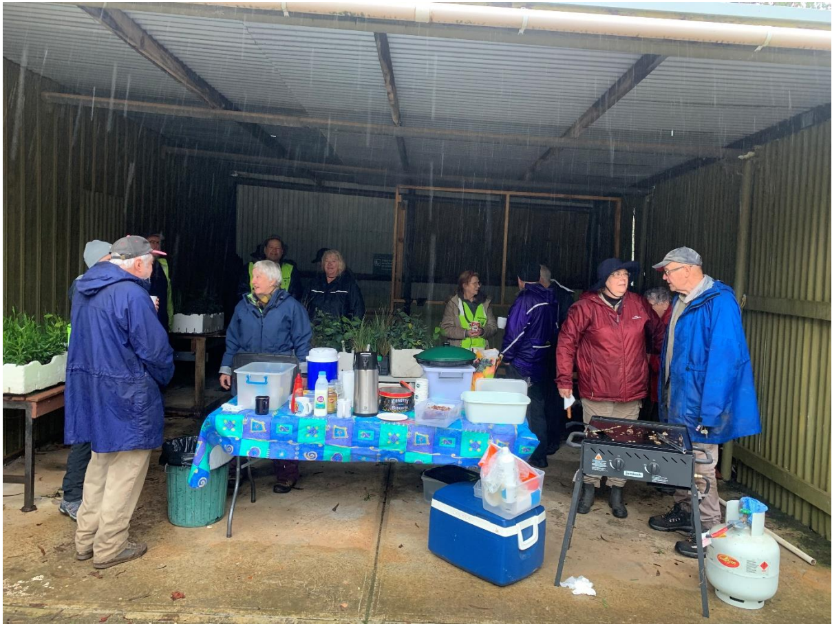
At the carport alongside the shed