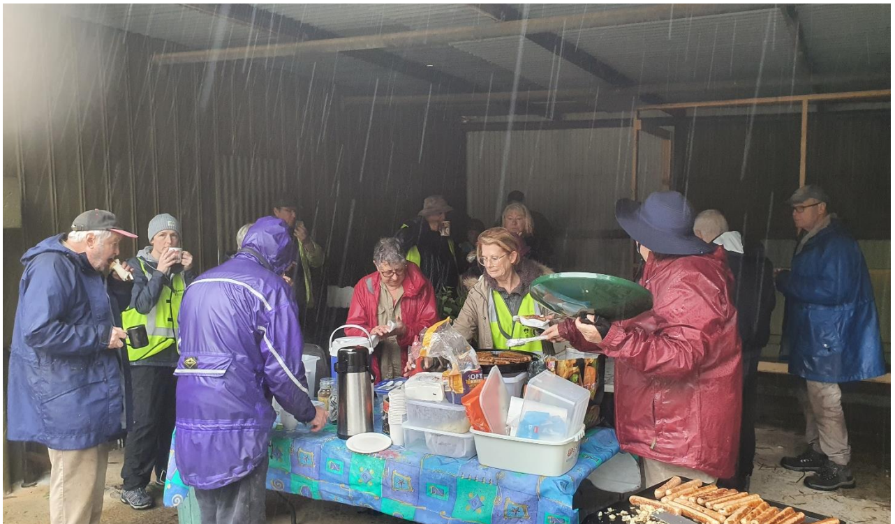
Brunch sheltering from the rain after the planting was done.