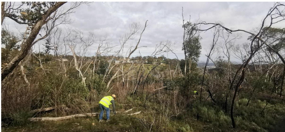
Working with a beautiful view in the distance