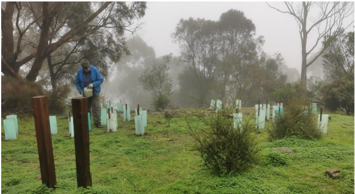
Near the Lookout