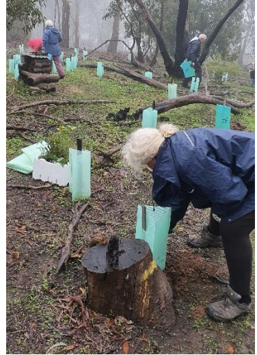
Near the Bee Hotel