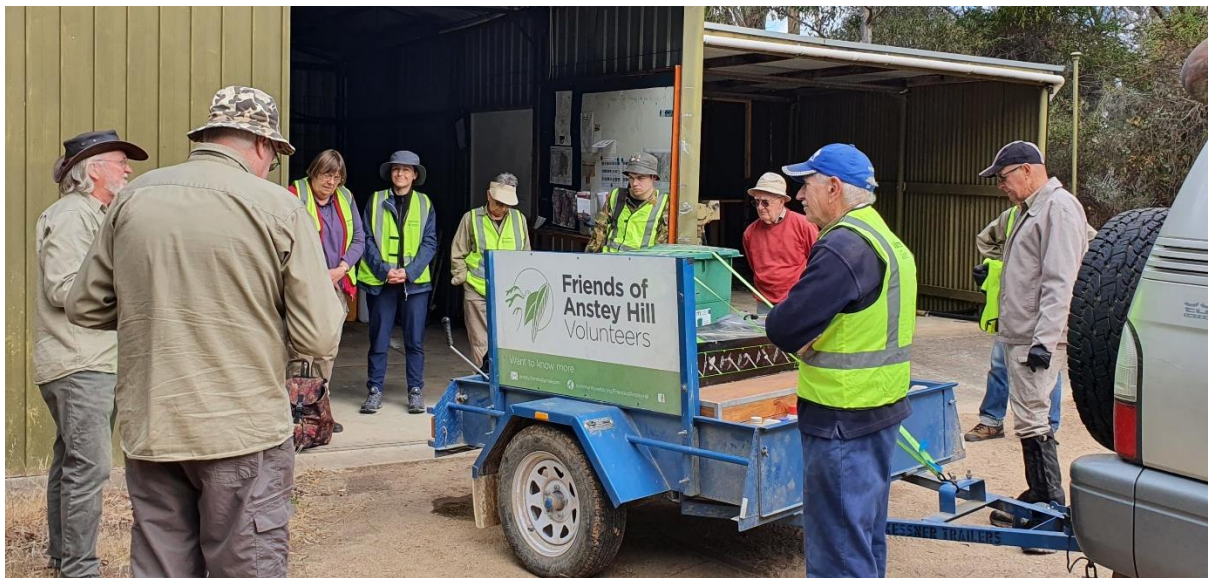
Early morning briefing on a warm day